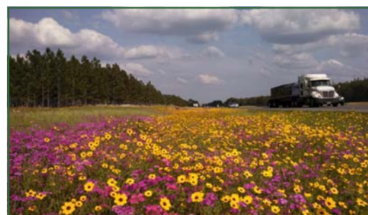
FDOT interstate median planting of goldenmane tickseed ( Coreopsis basalis) and annual garden phlox ( Phlox drummondii) (native to Texas). Although the plantings are not entirely native, native wildflowers such as Southern fleabane ( Erigeron quercifolius) and Carolina woollywhite ( Hymenopappus scabiosaesus) also find friendship there.