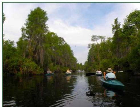
Thursday field trip: kayaking through the Okefenokee Swamp