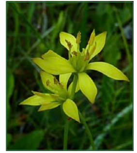
Harper's Beauty (Harperocallis flava) is a rare endemic species, occurring in only a small area of the Florida panhandle. A federally listed endangered species, it has been protected by reduced mowing schedules along State Road 65 through the Apalachicola National Forest in Liberty County.

The Magnolia Chapter Calendar Committee has selected the most special plants of Florida’s Big Bend and Panhandle as the focus of the 2014 Notes from the Field Calendar , the endemic plants that are found only in the region. This will be the 10th edition of the beautifully arranged and botanically correct wall calendar, the Magnolia Chapter’s major fundraiser supporting roadside wildflowers, native plant research grants, exotic plant eradication education and more! The committee is currently compiling submittals of compelling photographs, which will be sorted, described and laid out this summer. Contact Pat Stampe ( patriciastampe@netscape.net ) or Amy Jenkins ( fnpsmagnoliach@gmail.com ) to help with this project, or if you think your chapter would be interested in a box of calendars next fall. They make excellent Christmas presents to friends and family, even that hard to shop for person who has everything and can only stand so many pinup shots of grey wolf puppies and polar bear cubs!