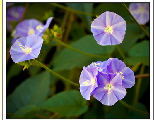
Skyblue Clustervine ( Jacquemontia pentanbos )

Autumn has arrived! You may have to look for plants changing color and they are! Along the roadside you may see Goldenrod, Broomsedge and Salt Myrtle. Virginia Creeper is turning red and so is Red Maple. Leaves are dropping and the grape vine is beginning to turn yellow along with American Elm. My Climbing Aster is in bloom and so is my Wild Hoarhound ( Ageratina aromaticum ) and Muhly grass. The Skyblue Clustervine is almost done but what a display! A photo of the Skyblue Clustervine is shown on the right. You must always enjoy nature and the seasonal changes!