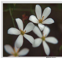
Model Native Plant Landscape Ordinance Handbook

These landscape ordinance guidelines are intended to be used by local governments that wish to adopt or amend their existing landscape ordinance to encourage or require the use of appropriate native vegetation in all landscaped areas. This document provides sample language that can be adopted (in whole or in part) by a local government that wants to promote these goals and acquire the benefits of appropriate native landscaping. Many local officials simply don't know about such landscape ordinances. You could be a valuable resource for them. Share your knowledge (as we learn also ) about the many benefits of native landscaping. Call or get on the Internet & find out who your local officials are that would be involved in the landscaping of your own community. Contact them. Be Green.