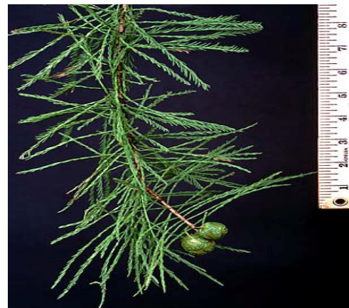
Pondcypress leaves are similar to Baldcypress, but needles are pressed against the stem