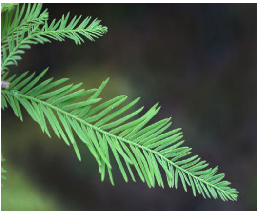
The pale green, needle-like Baldcypress leaves turn brilliant coppery in the fall before dropping.

Cypress trees can live for hundred of years, has "knees" that protrude above the soil, and loses its leaves in the winter, hence the "bald" cypress name. Some studies have reported that cypresses' "knees" and buttressed trunks serve to supply oxygen to the roots of the trees and also anchor and support the tree in an unstable environment (Dennis 1988). The knees are a part of the root system which grows above the soil. Knees vary in height: some are reported up to 12 feet (Dennis 1988).