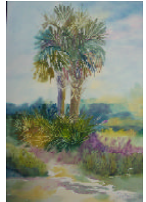
Sabal Palm and Palmettos by Pat Fadden

The Shores Resort and Spa 2637 South Atlantic Ave ~ Daytona Beach Shores 1.866.934.SHORES ~ www.ShoresResort.com