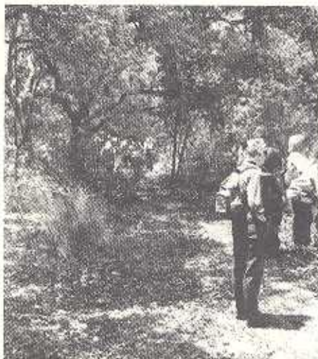
Field trippers at Brooker Creek Preserve.

Conference Sponsors Central Florida Native Flora Plans for Tomorrow St. Petersburg Audubon Society South Trust Bank