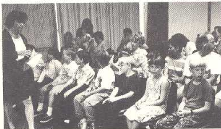
Children from Bear Creek Elementary School, St. Petersburg, read their charming compositions about their nature trail.