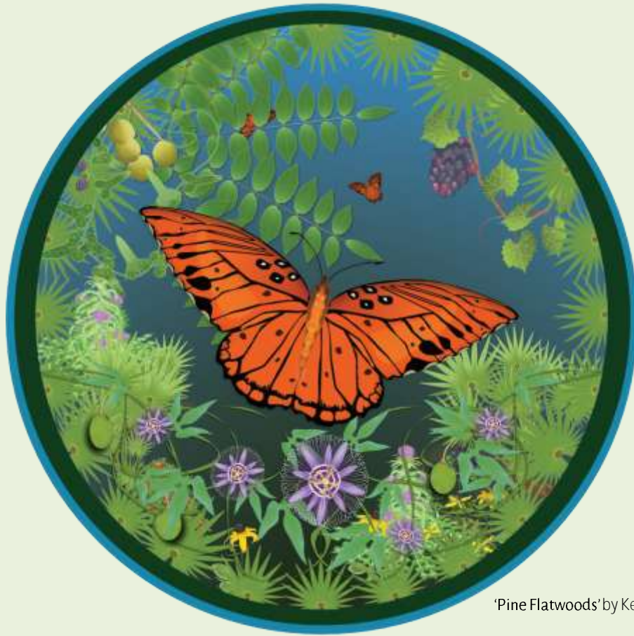
'Pine Flatwoods' by Kevin Shea, kevinshea.net