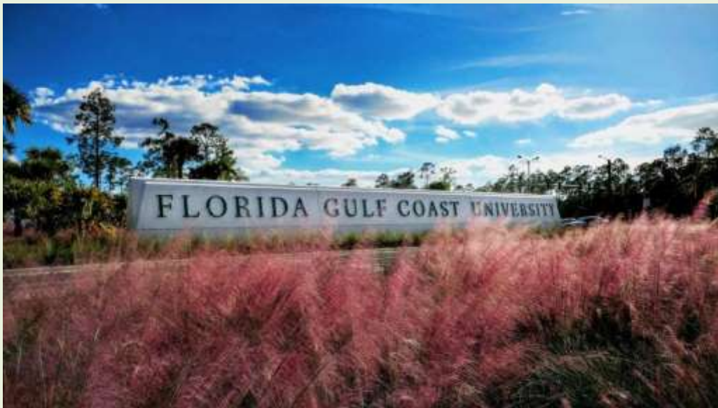
Institutional Award of Excellence - Florida Gulf Coast University Main Entrance