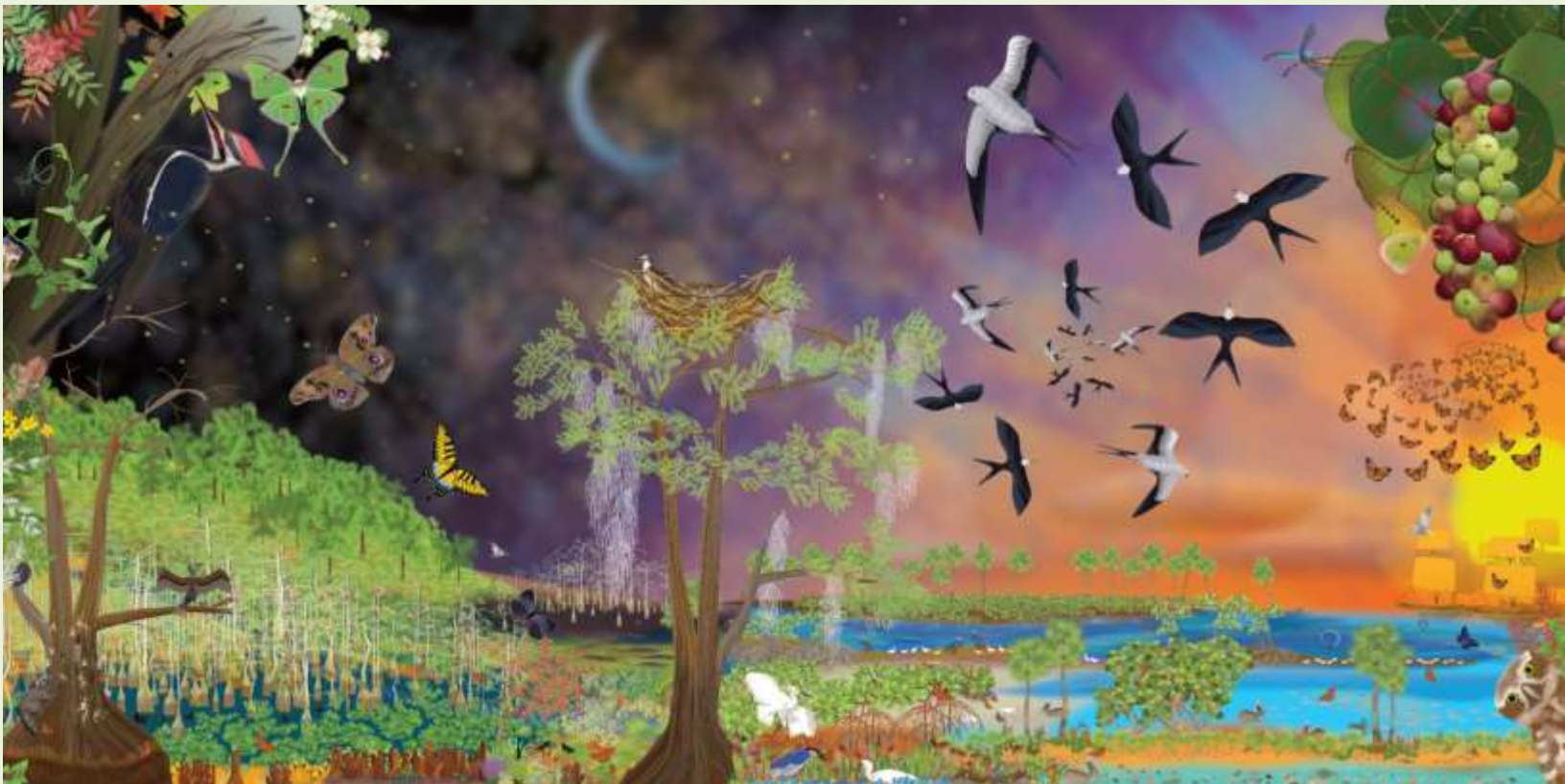
'South Florida Native Plants' by Kevin Shea, kevinshea.net