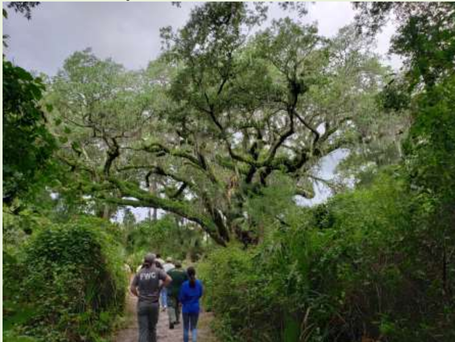
Florida's second largest Live Oak tree at Lake Griffin State Park is approximately 400 years old.

FNPS provided expert assistance to Florida's land managers through our participation in 5-year and 10-year land management reviews. The FNPS Land Management Partners Committee worked with the Florida Department of Environmental Protection (FDEP) to schedule local FNPS members for each review. Each land management review requires between 20-25 hours in preparation and on-site participation. The onsite land management reviews ensure that the each property is being cared for in accordance with approved management plans. In fiscal year 2018-2019 FNPS members participated in 17 reviews, or 100% of all land management reviews for the year.