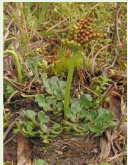
Winter Grape Fern ( Botrychium lunarioides).

Tarflower – assisted other chapters, heavy participation in Castle Hill rescue and associated restorations, Native Plant Month Central Florida Regional Meeting.