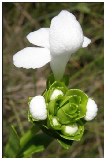
Endemic and endangered white birds-in-a-nest (Macbridea alba), taken on Pitcher Plant Prairies of Apalachicola National Forest field trip.

Not sure what to share? Simply upload them to (or share them with) our FNPS facebook page ( www.facebook.com/FNPSfans ). You do not need to be a professional photographer! It is good memories that we seek to share and document. Check out our Flickr site ( www.flickr.com/photos/fnps/ ), our 2015 Conference album ( www.flickr.com/photos/fnps/sets/72157653899933922 ) and our Facebook page ( www.facebook.com/FNPSfans ) to see what others have already shared and please consider sharing your photos today.